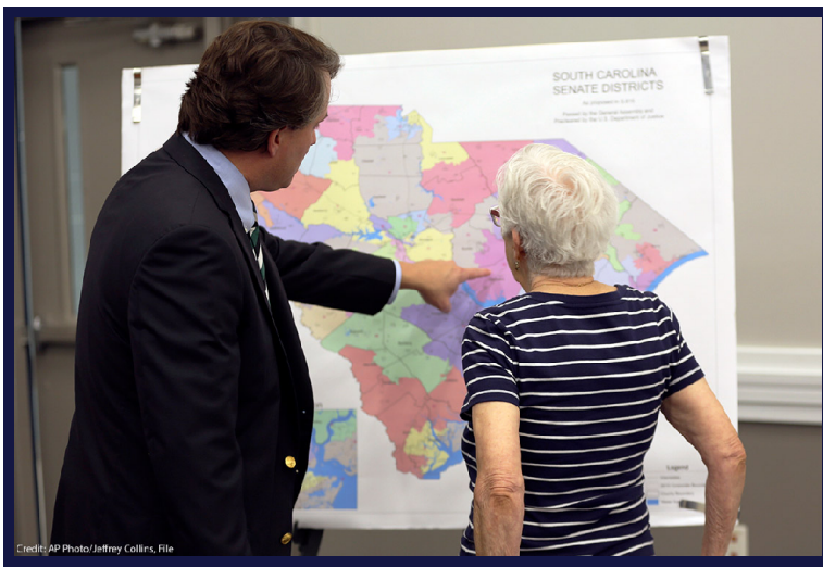
Prospective voters consider SC congressional districts.

Of all the conservatives, Justice Samuel Alito was most persistent in questioning the plaintiffs' (KEEP READING: https://www.nbcnews.com/politics/supreme-court/supreme-court-weighs-south-carolina-racial-gerrymandering-dispute-rcna118994 )